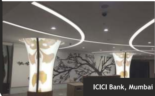
ICICI Bank, Mumbai