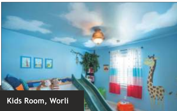
Kids Room, Worli