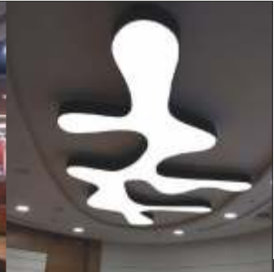
RBL Bank, Mumbai