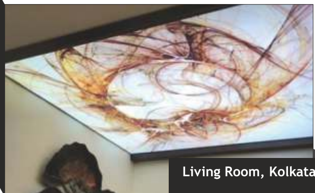
Living Room, Kolkata