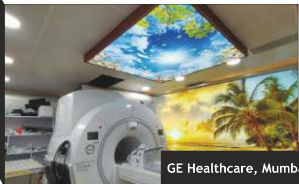
GE Healthcare, Mumbai