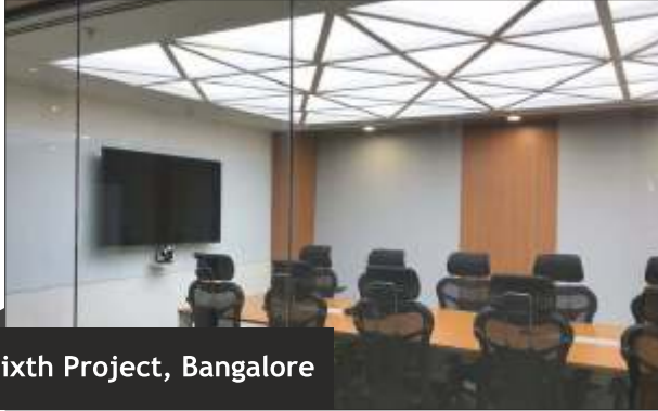
Sixth Project, Bangalore