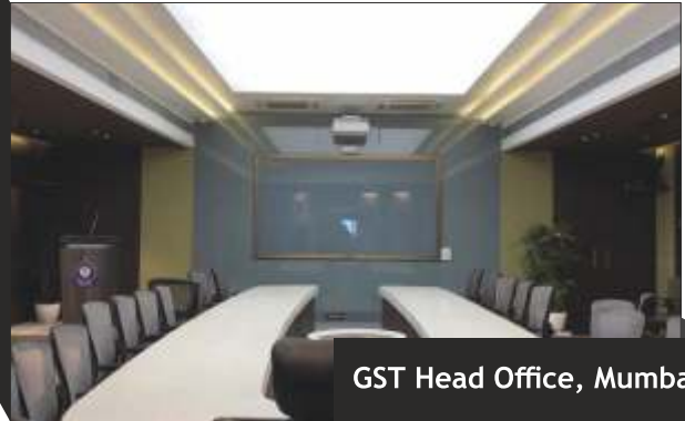
GST Head Office, Mumbai